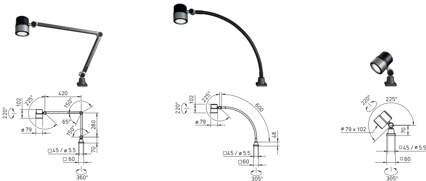
Measurements in millimeters